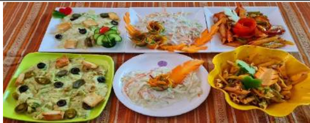
3. Pasta Salad