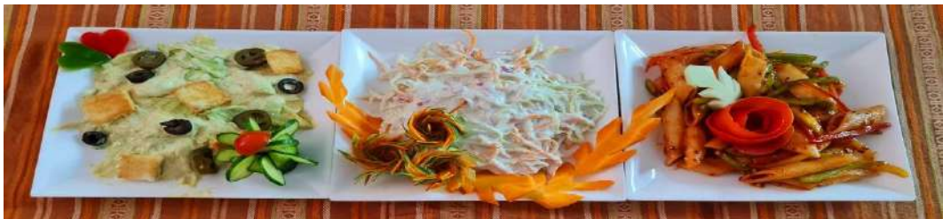
1. Ceaser Salad